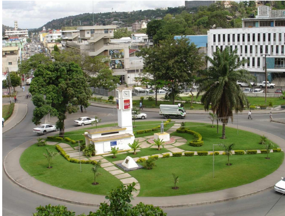
Photo: Central Round-about to depict City Beautification through Community Participation

For 9 years consecutively voted nationally as the Cleanest City in Tanzania (2006 - 2014)